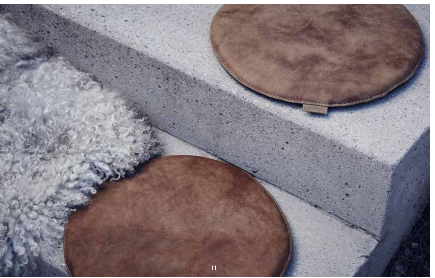
Pouffe Frida, sheepskin Ella and Torshavn