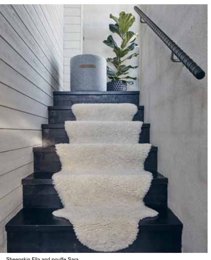
Sheepskin Ella and pouffe Sara