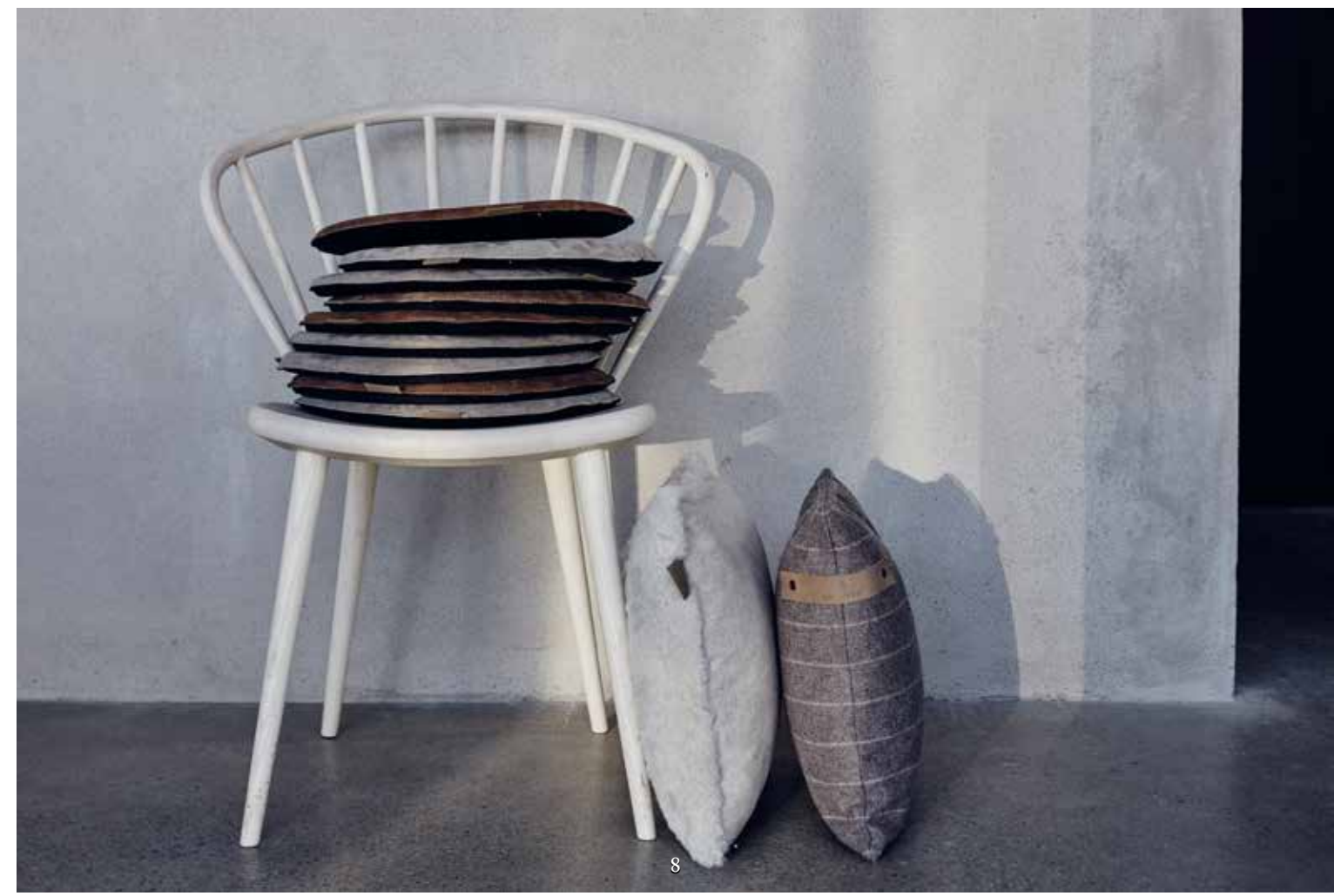
Seat cushion Sindra, pillow Lina and Marina