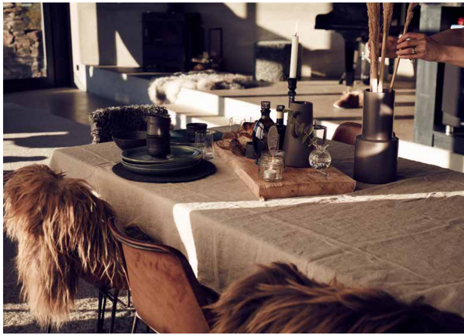
Sheepskin Torshavn and Visby, table mat Vilma