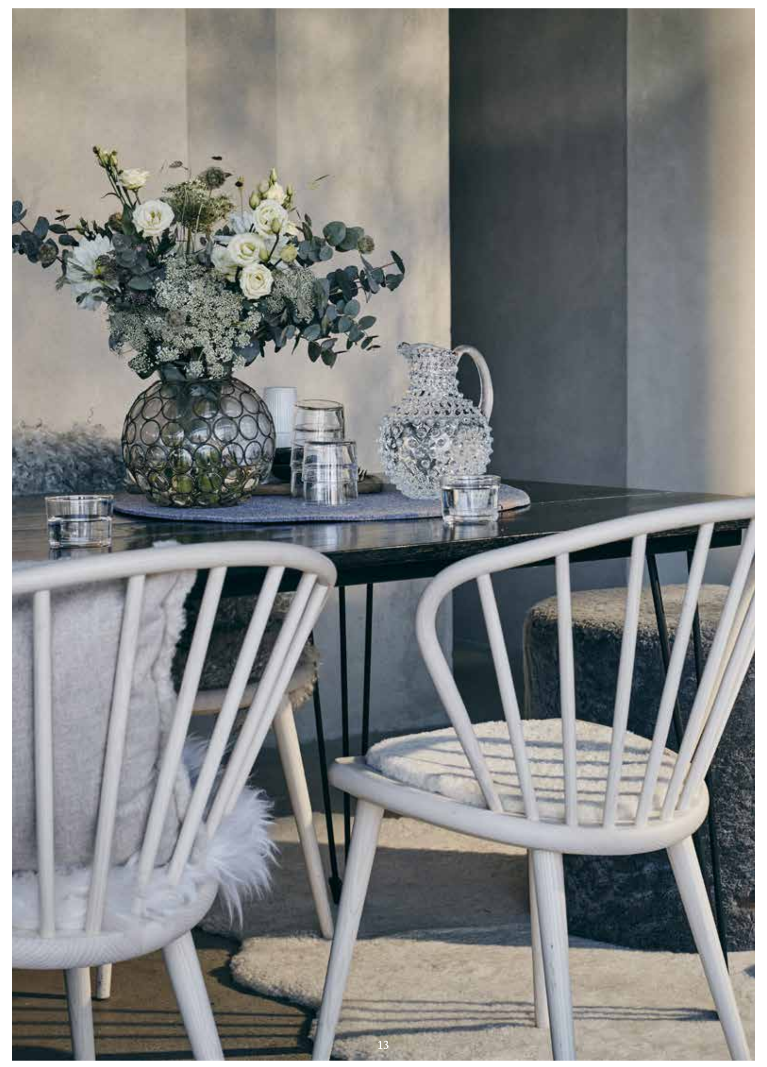
Sheepskin Sanda and Ella, pillow Lina, seat cushion Moa and Ellen, pouffe Frida and table mat Vilma.