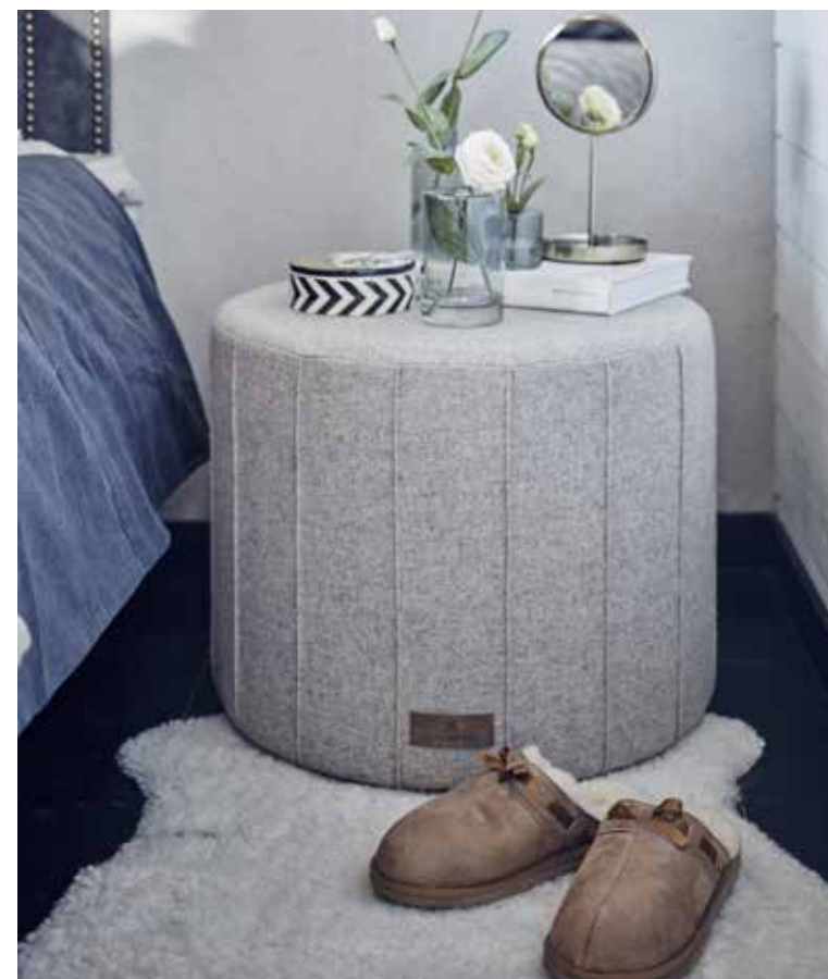
Pouffe Anja, sheepskin Ella and slippers Anne