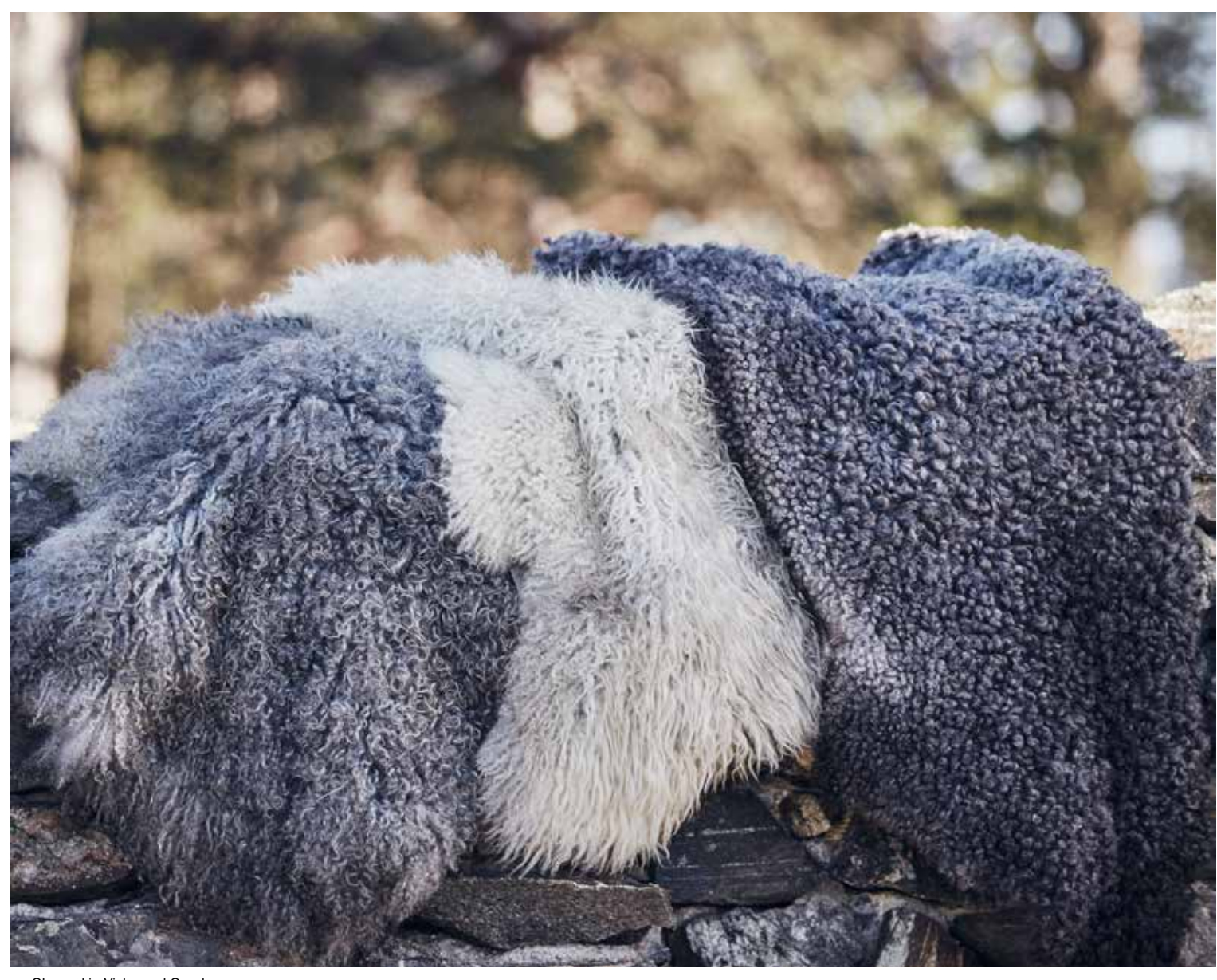
Sheepskin Visby and Sanda

Working with sheepskin never ceases to enthral us. The skins living structure and texture makes each product unique. Complete in its own right; Completely natural.