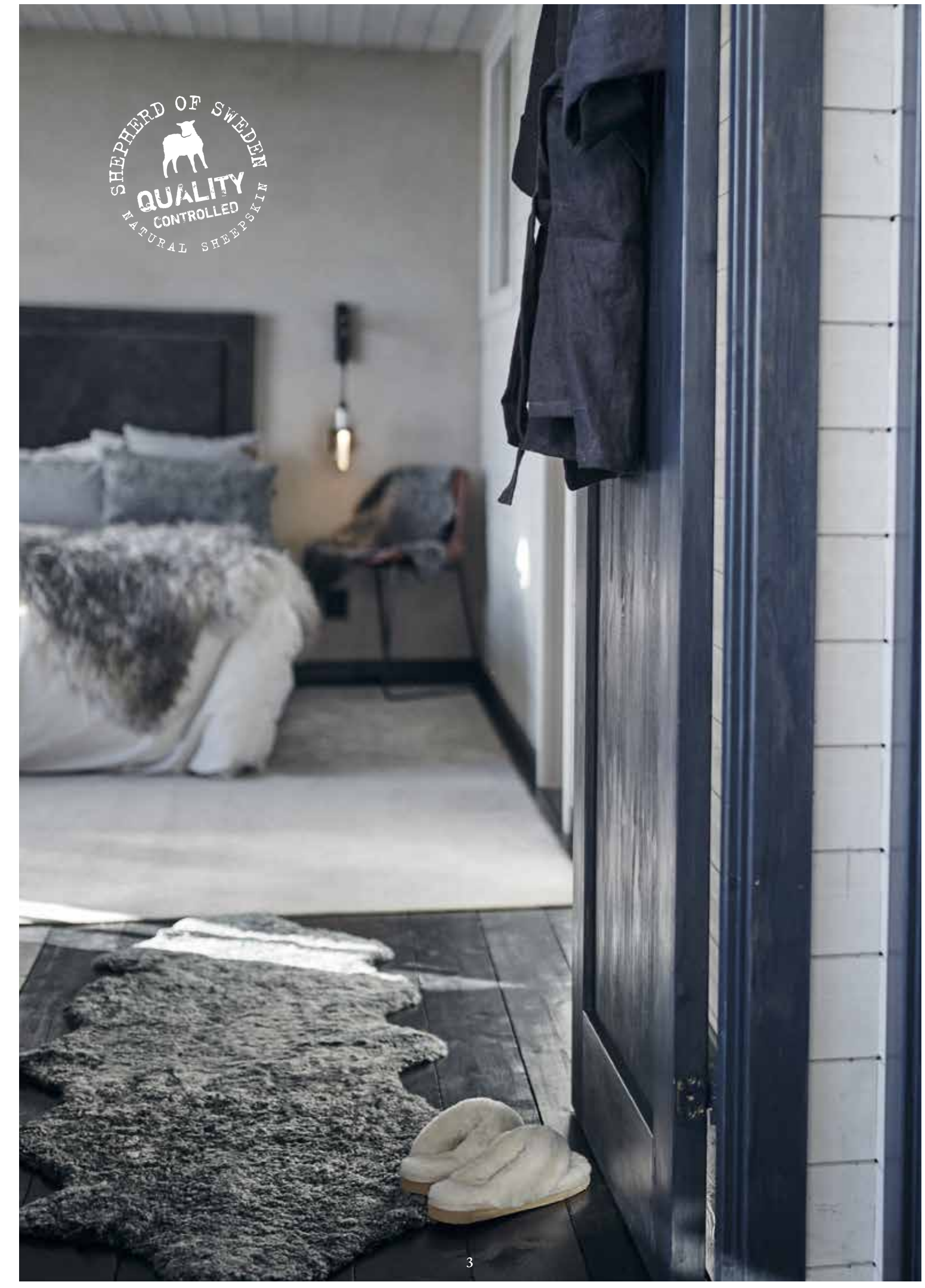
Sheepskin Ella and slippers Pernilla