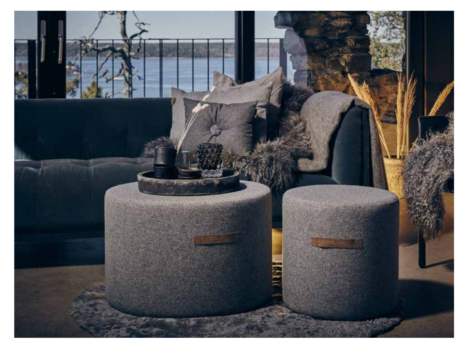
Rug Ebba, sheepskin Sanda, pouffe Sara, pillow Anita and Tina and plaid Leia