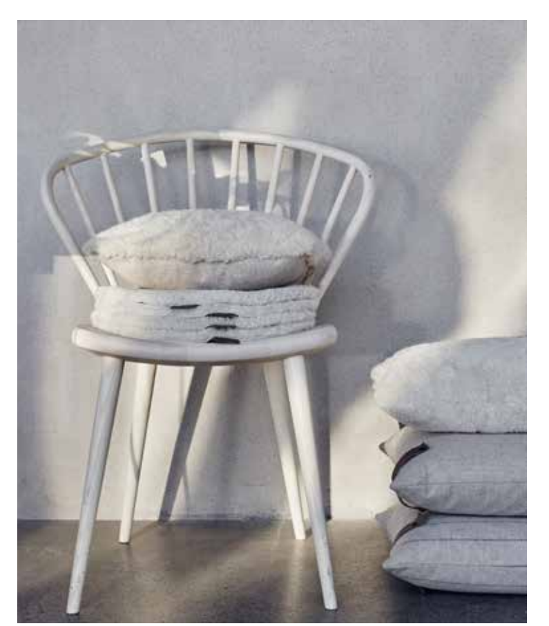
Pillow Lina, seat Cushion Ida, pillow Alice, Tina and Marina

We love wool, sheepskin and genuine quality. To us Shepherd stands for combining great Scandinavian design and craftmanship. Products to live with – and to enjoy for a long time.